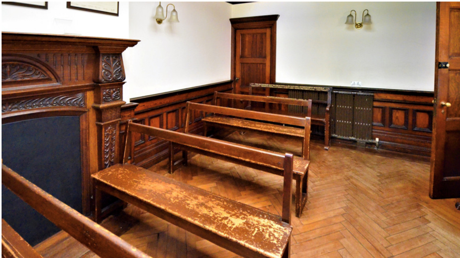
Society in London: Foundry

I then testified openly to all there what I now first felt in my heart."